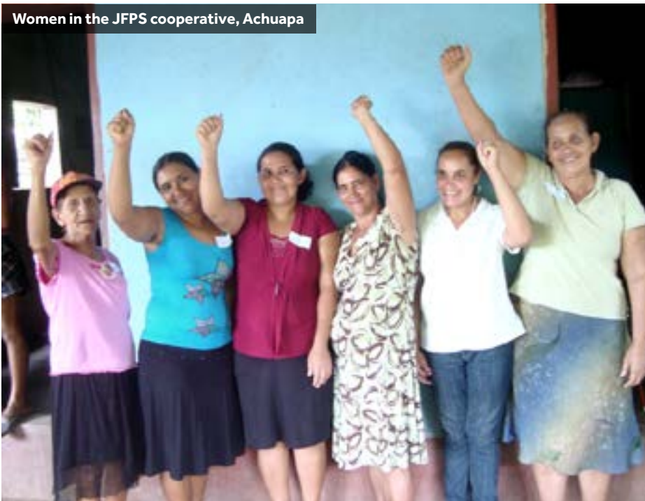
Women in the JFPS cooperative, Achuapa