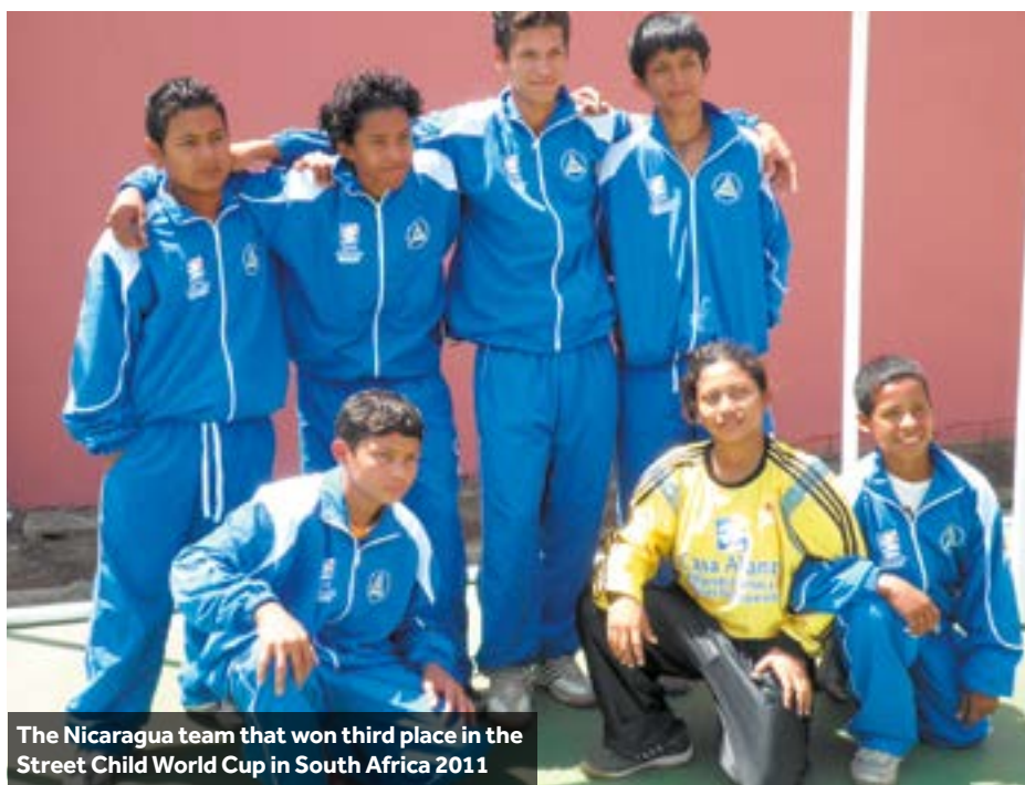
The Nicaragua team that won third place in the Street Child World Cup in South Africa 2011

What happened after you returned to Nicaragua? I went back to school and I'm finishing my 5th year of secondary school.