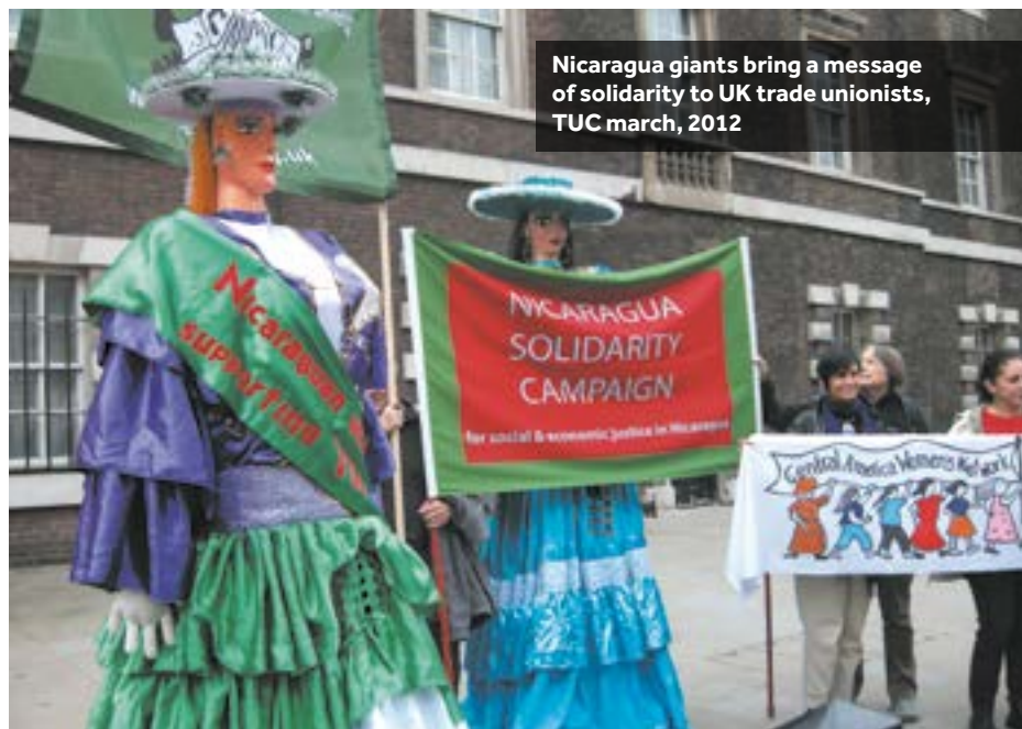
Nicaragua giants bring a message of solidarity to UK trade unionists, TUC march, 2012